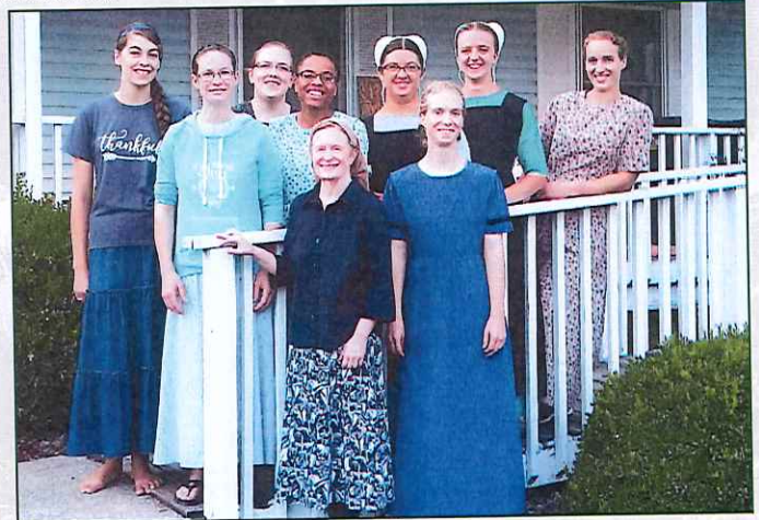
Group of Volunteers