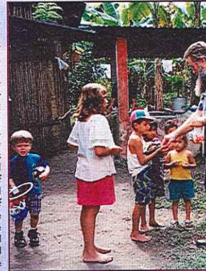
Dad passing out candy in Honduras

We have been blessed with more VS girls lately who come to volunteer for three months. Two girls arrived a week ago from Pennsylvania, one from New York and one from Iowa to serve a three-month volunteer service. Also arriving at the end of February is a team of VS girls from PA for two weeks to help with any work that is available. All the above girls are either Mennonite or Amish. Our VS girls have always been the backbone of the Ministry. Really, without them we could not function. I would never be able to estimate how many we have had over the decades and of course we get carpenter work teams in as well as the girls.