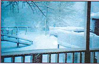
Yes, we do get snow, not often. No this is NOT Rexford Montana