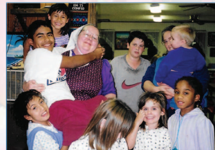
No matter what the kids were doing, Mom loved them all! This is Mom with a portion of our family around 1998.

I hate that my babies are missing out on those moments