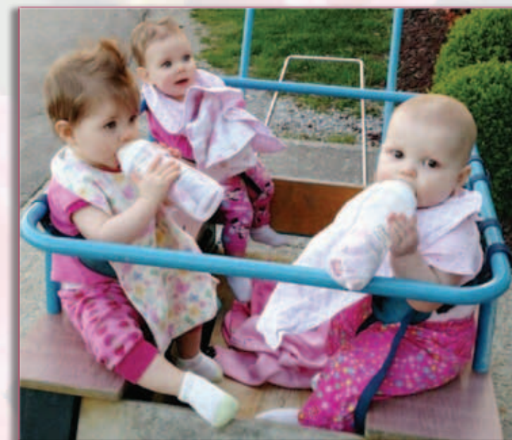
Our Born Free babies enjoying a meal on the go!

Galilean Home Ministries is a non-profit, donation-funded ministry providing children of ALL ages a place to call HOME. With our wonderful staff, volunteers, and supporters we strive to be home, not "a home." We are a family, not an institution, trying to give all in our care the normal joys of childhood and a sense of belonging that anyone else has in their own families.